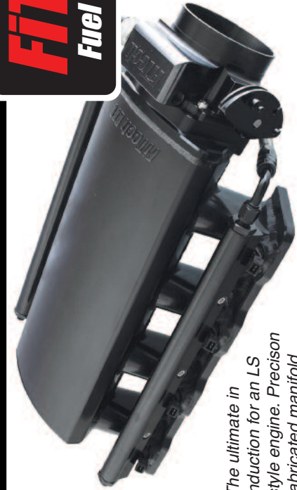
The ultimate in induction for an LS style engine. Precision fabricated manifold.