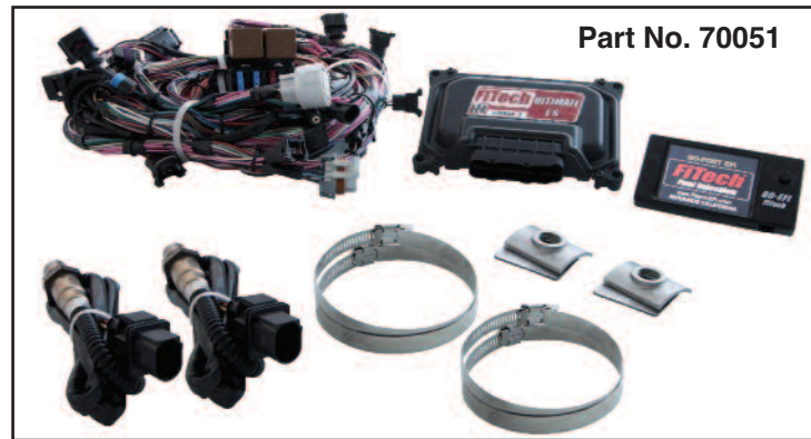
Part No. 70051

A self learning dual wideband Ultimate LS ECU is available. With or without Transmission Control. This is the ideal system for engine swaps where the factory computer is replaced by the FiTech unit which is not only self learning but allows for a wide range of tuning adjustments not available with the O.E. computer.