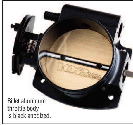
Billet aluminum throttle body is black anodized.

A self learning dual wideband Ultimate LS ECU is available. With or without Transmission Control. This is the ideal system for engine swaps where the factory computer is replaced by the FiTech unit which is not only self learning but allows for a wide range of tuning adjustments not available with the O.E. computer.